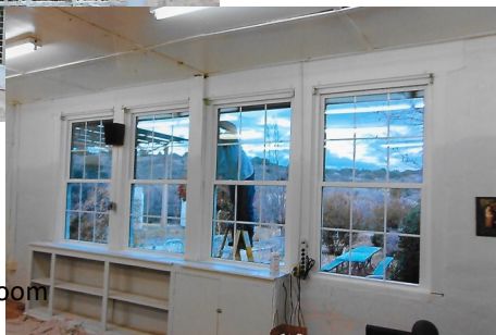
New Windows Front Room