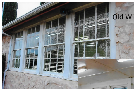
Old Windows Front Room