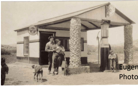
Eugene McGuire's Gas Station